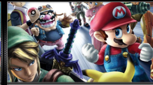
SUPER SMASH BROS NOW AVAILABLE