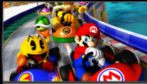
MARIO KART NOW AVAILABLE