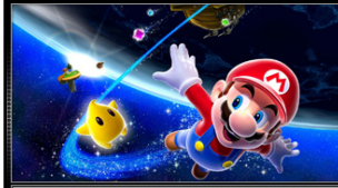
MARIO GALAXY NOW AVAILABLE